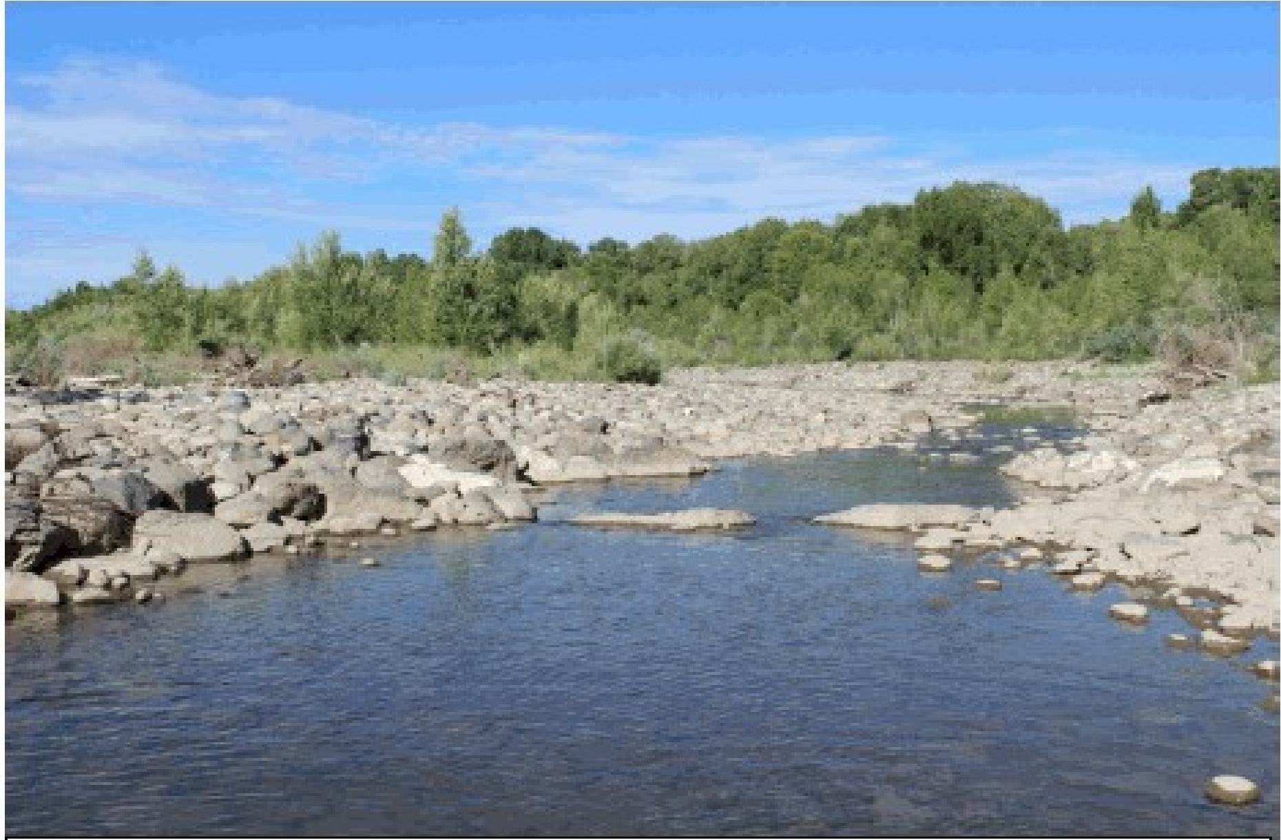
New pool above rock weir