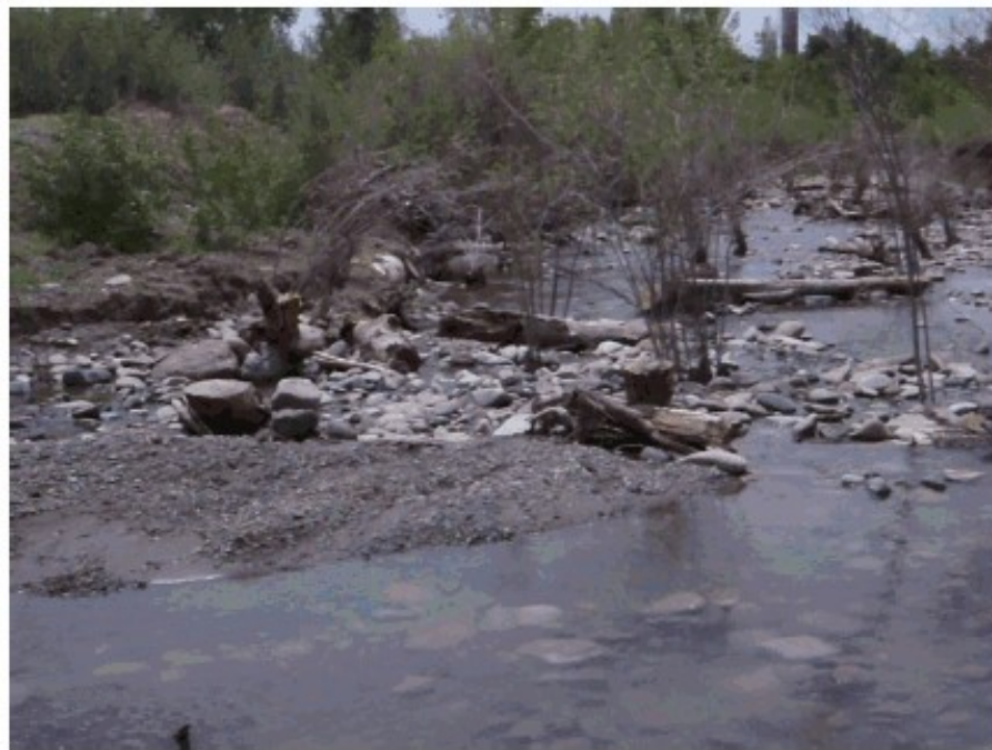
South side channel May 2013