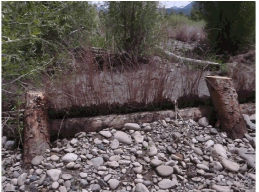
Debris and sediment captured & some growth