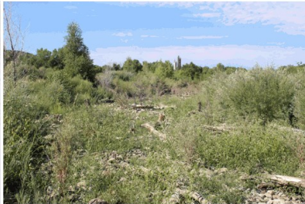
South side channel August 2013